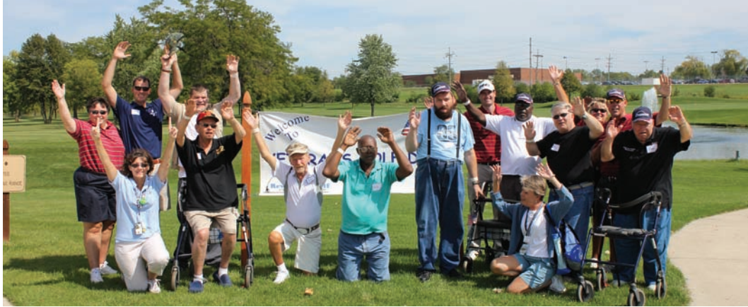
Veterans, golf instructors and therapists celebrate after a day with RevelationGolf

The morning session is dedicated to veterans who are coping with a variety of physical issues such as post-traumatic stress disorder, brain injuries, physical and/or neurological limitations and blindness.