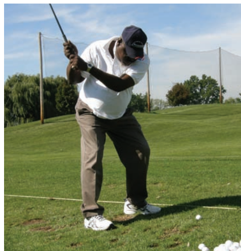
A veteran practices on the driving range at Willow Glen