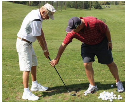
A RevelationGolf teaching professional practices with a veteran at Willow Glen