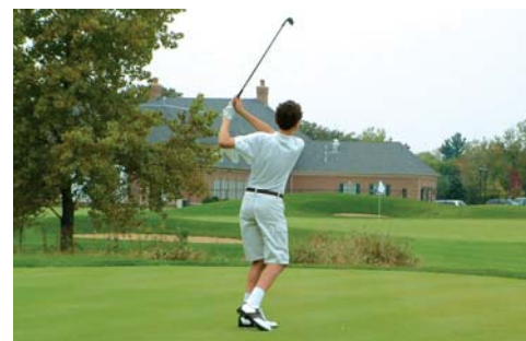
Third tee on the Sunshine Course

Fortune Brands' products are not only world-class but so is their philanthropy. Their efforts are truly inspirational and because of their commitment, the Foundation is delivering the largest grass roots golf program for individuals with disabilities in the country.