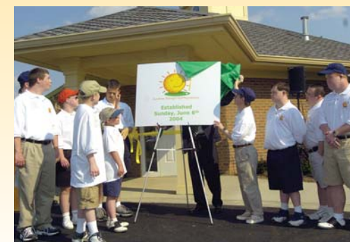
Sunshine Through Golf participants unveil new logo.

Development of Midwest Golf House began with a dream brought on by the CDGA Board of Directors. Through the $7.2 million Sunshine Through Golf