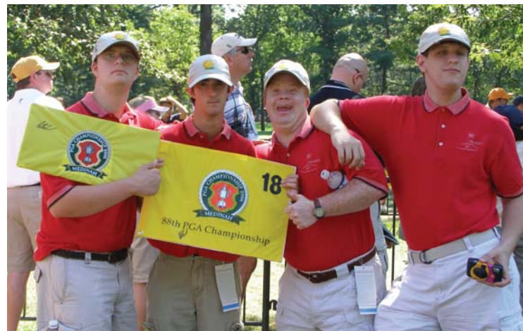
Medinah granted its athletes in the Sunshine Through Golf camp program special access during PGA Championship week.