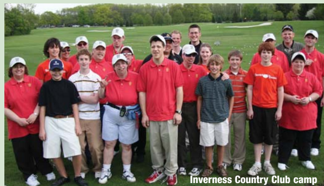
Inverness Country Club camp