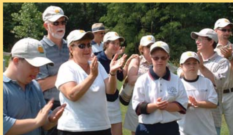
Sunshine Through Golf participants enjoy themselves at the Sunshine Tournament.

The Sunshine Course at Midwest Golf House in Lemont provides the ideal venue for the athletes. The par-3 course and its handicap-accessible facility was built with the Sunshine Through Golf campers in mind.