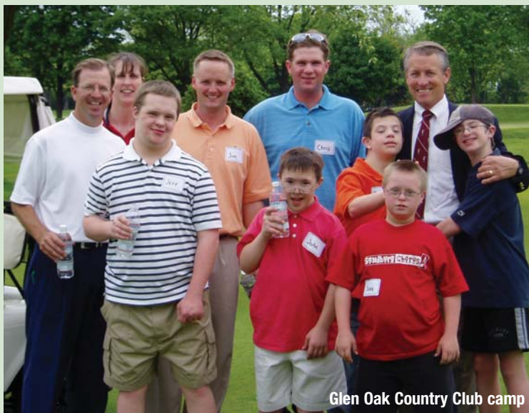
Glen Oak Country Club camp

Aurora Country Club Beverly Country Club Biltmore Country Club Boulder Ridge Country Club Bryn Mawr Country Club Butler National Golf Club Butterfield Country Club Calumet Country Club Chicago Golf Club Conway Farms Golf Club Cress Creek Country Club Crystal Lake Country Club Crystal Tree Golf & Country Club Dunes Club Edgewood Valley Country Club Elgin Country Club Evanston Golf Club Geneva Golf Club Glen Flora Country Club Glen Oak Country Club Glen View Club Hinsdale Golf Club