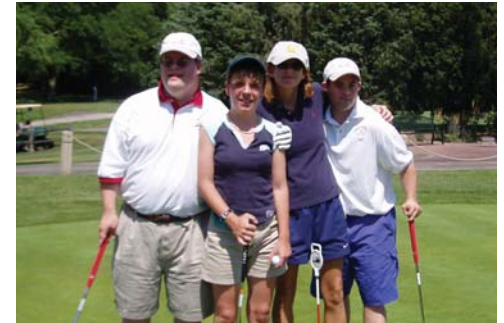
Maine-Niles Association of Special Recreation athletes in the Golf Center of Des Plaines camp test Fortune Brands equipment.

Many Sunshine Through Golf campers do not have their own clubs let alone access to golf courses. Participation in camps and playing a golf course would not have been possible for some without the generosity of Fortune Brands.